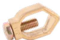
Earth rod Coupler & Clamp 16 & 20mm