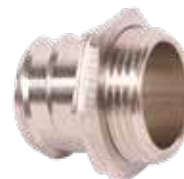
Adaptor - Brass / Nickel plated 20 & 25mm